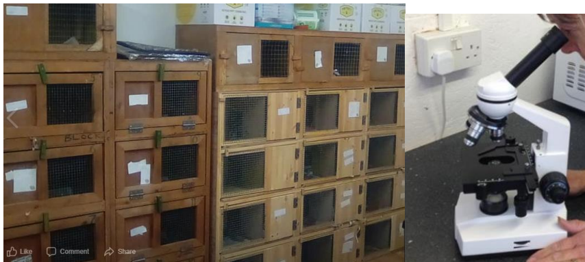
Hedgehog Haven's hogspital in North Walsham

Hodmedod's Hedgehog Support helped fund the two hogspitals shown above as well as helping many other rescue centres throughout Norfolk. It also continues to raise awareness of the plight of our hedgehogs which are in serious decline.