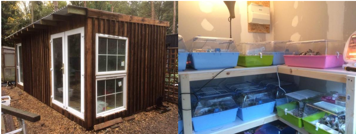
Hallswood Animal Sanctuary's hogspital in Stratton Strawless

This 'rubbish' will be sent to Terracycle for recycling and the credits received will be converted into cash to help support hedgehog rescuers with much needed equipment, medication and food.