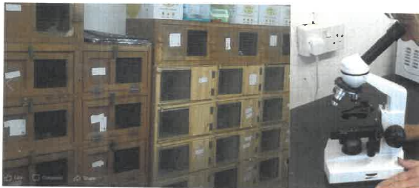
Hedgehog Haven's hogspital in North Walsham

Hodmedod's Hedgehog Support helped fund the two hogspitals shown above as well as helping many other rescue centres throughout Norfolk. It also continues to raise awareness of the plight of our hedgehogs which are in serious decline.