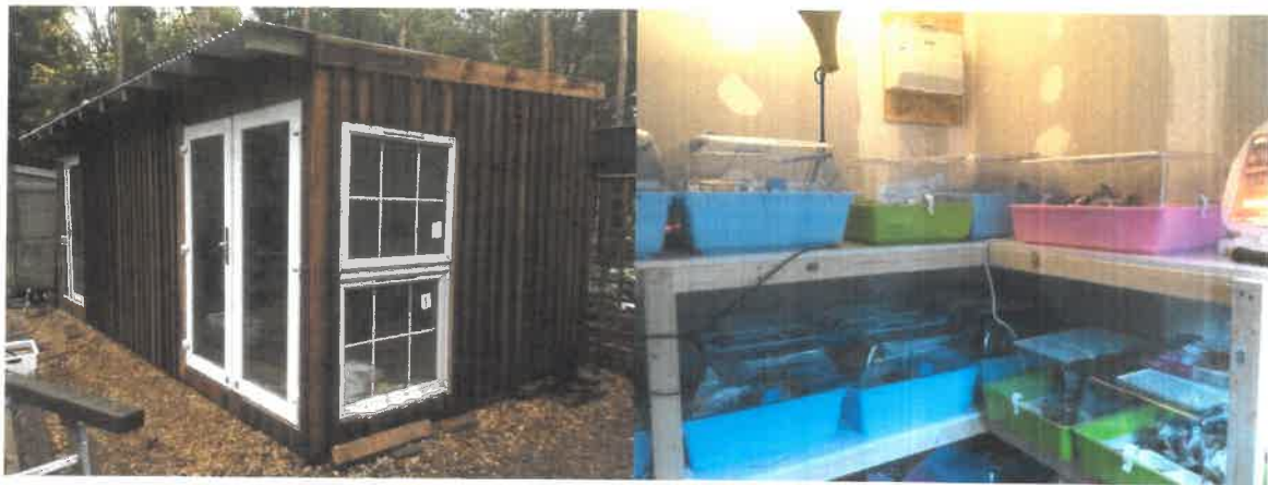
Hallswood Animal Sanctuary's hogspital in Stratton Strawless

This 'rubbish' will be sent to Terracycle for recycling and the credits received will be converted into cash to help support hedgehog rescuers with much needed equipment, medication and food.