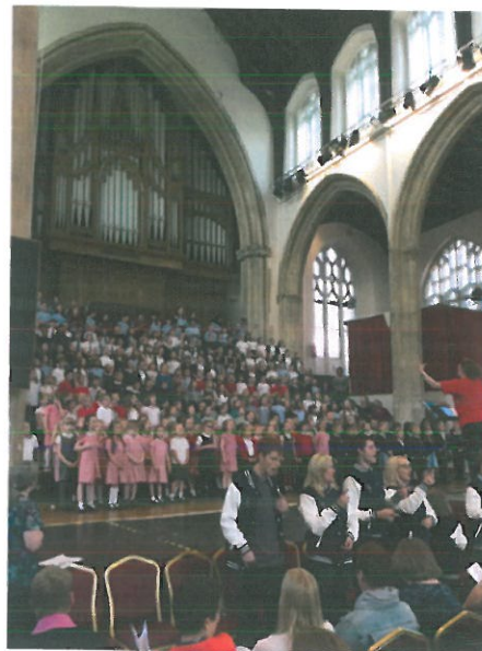
A lovely Friday afternoon!