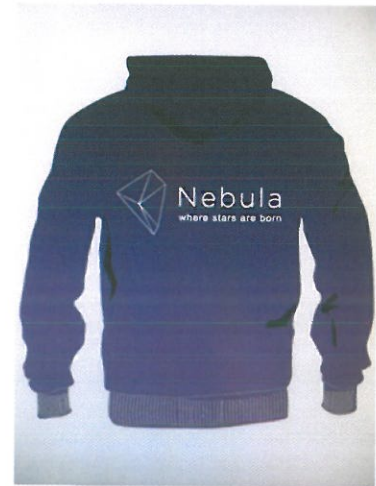
A NEBULA HOODIE

A huge thank you to everyone who performed - and a massive thank you to our audience; for your enthusiasm and patience!