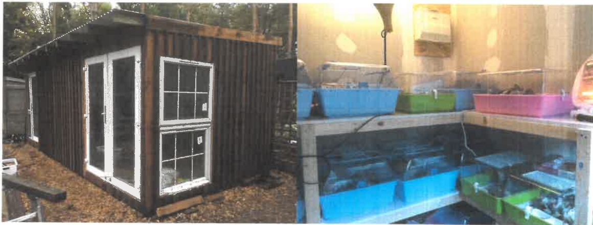
Hallwood Animal Sanctuary's hogspital in Stratton Strawless

This 'rubbish' will be sent to Terracycle for recycling and the credits received will be converted into cash to help support hedgehog rescuers with much needed equipment, medication and food.