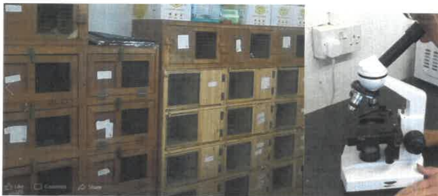
Hedgehog Haven's hogspital in North Walsham

Hodmedod's Hedgehog Support helped fund the two hogspitals shown above as well as helping many other rescue centres throughout Norfolk. It also continues to raise awareness of the plight of our hedgehogs which are in serious decline.