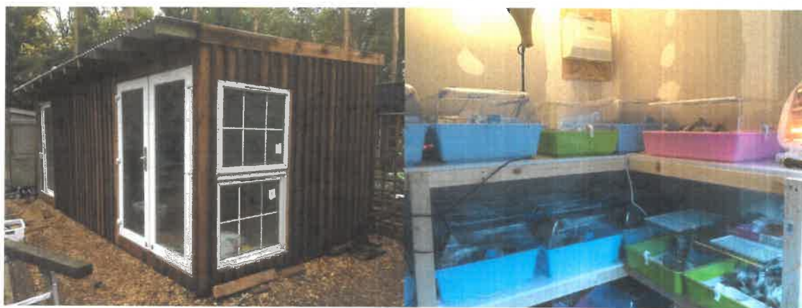
Hallswood Animal Sanctuary's hogspital in Stratton Strawless

This 'rubbish' will be sent to Terracycle for recycling and the credits received will be converted into cash to help support hedgehog rescuers with much needed equipment, medication and food.