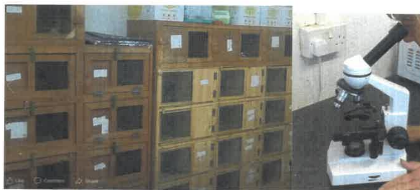
Hedgehog Haven's hogspital in North Walsham

Hodmedod's Hedgehog Support helped fund the two hogspitals shown above as well as helping many other rescue centres throughout Norfolk. It also continues to raise awareness of the plight of our hedgehogs which are in serious decline.