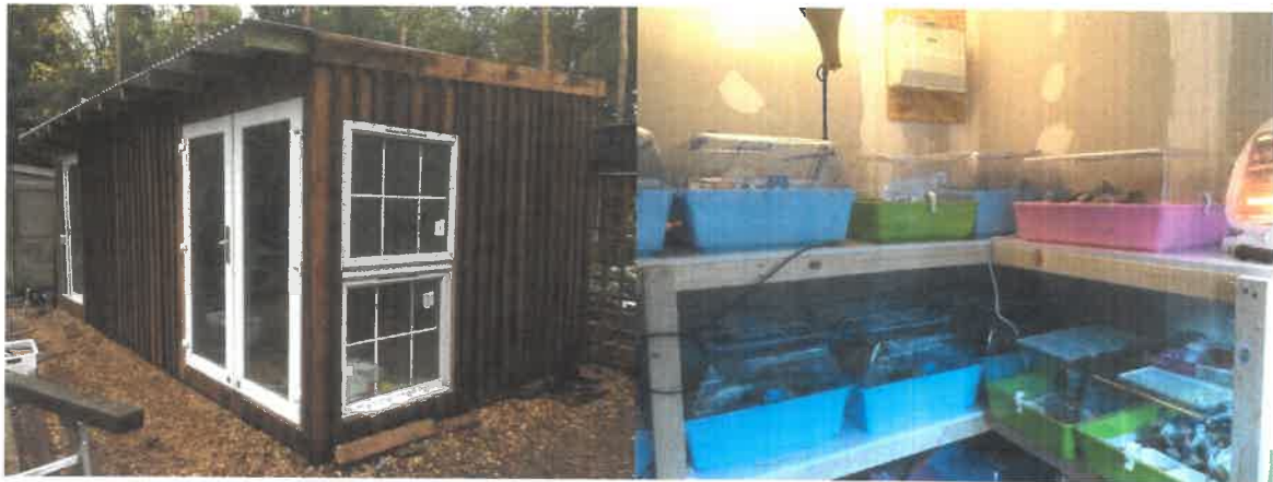
Hallswood Animal Sanctuary's hogspital in Stratton Strawless

This 'rubbish' will be sent to Terracycle for recycling and the credits received will be converted into cash to help support hedgehog rescuers with much needed equipment, medication and food.