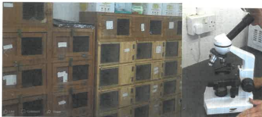
Hedgehog Haven's hogspital in North Walsham

Hodmedod's Hedgehog Support helped fund the two hogspitals shown above as well as helping many other rescue centres throughout Norfolk. It also continues to raise awareness of the plight of our hedgehogs which are in serious decline.