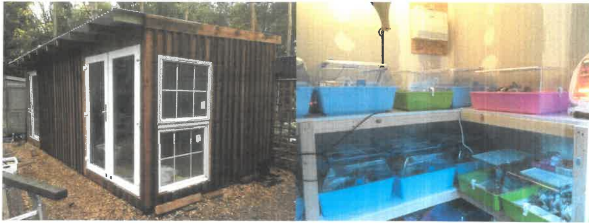
Hallswood Animal Sanctuary's hogspital in Stratton Strawless

This 'rubbish' will be sent to Terracycle for recycling and the credits received will be converted into cash to help support hedgehog rescuers with much needed equipment, medication and food.