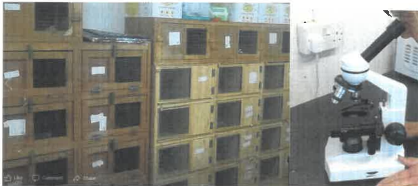
Hedgehog Haven's hogspital in North Walsham

Hodmedod's Hedgehog Support helped fund the two hogspitals shown above as well as helping many other rescue centres throughout Norfolk. It also continues to raise awareness of the plight of our hedgehogs which are in serious decline.