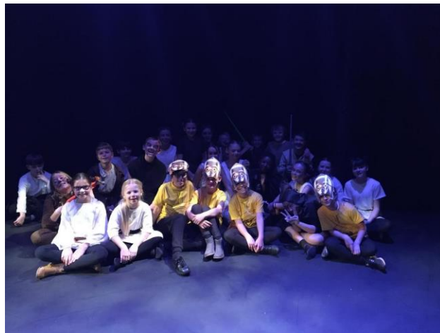
1 - Post Production Blues.